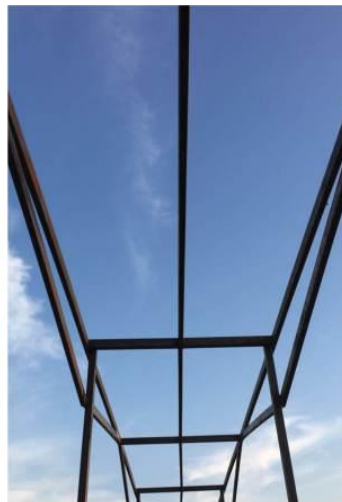
Albert Kaan | Untitled , 2018

Square pipe, wood, el-wire and mesh, 400x2000x84 cm