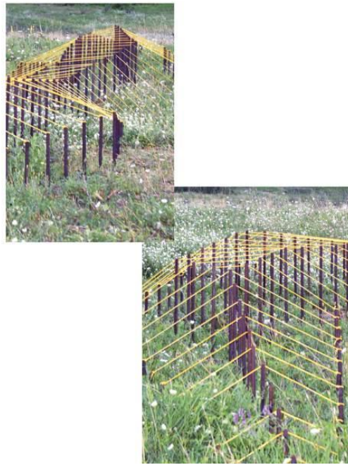
Petrica Stefan | Crossbreed series , 2018

Square pipe, cotton rope, 60×800150 cm